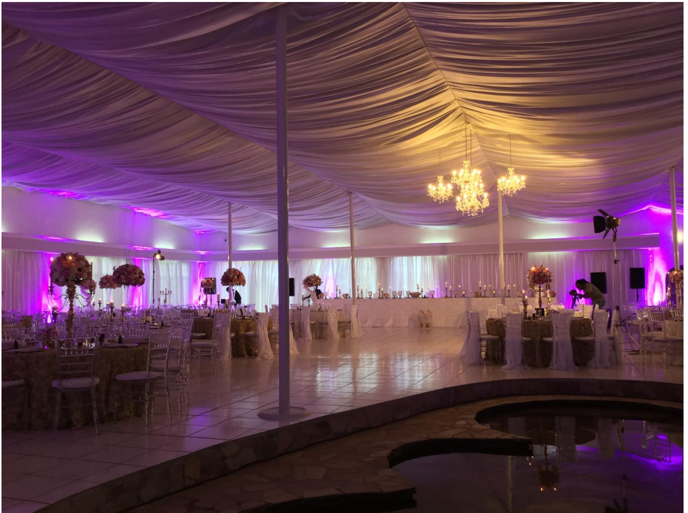
Deborah & Michael – 16 th December 2017

We met with Tiffany a couple of days before the wedding & she gave us a tour. The place was very clean and well groomed. The reception hall was huge and had more than enough room for all of our guest. The venue has a lovely indoor mini pond, which adds a nice touch to the overall look. There are enough bathrooms for guests and the bar area is in a perfect location.